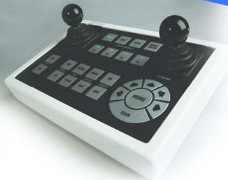
Optional Joystick controller shown

Weight 75-125 lbs. (34-57 kg) Length 22.5" (571 mm) Width 4.7" (120 mm) will vary with configuration