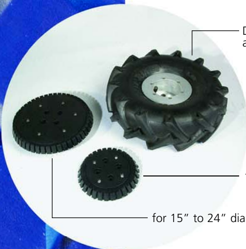
for 9" to 12" dia. pipes

A variety of wheels sizes and spacers makes the Brutus Crawler adaptable to a wide range of pipe diameters